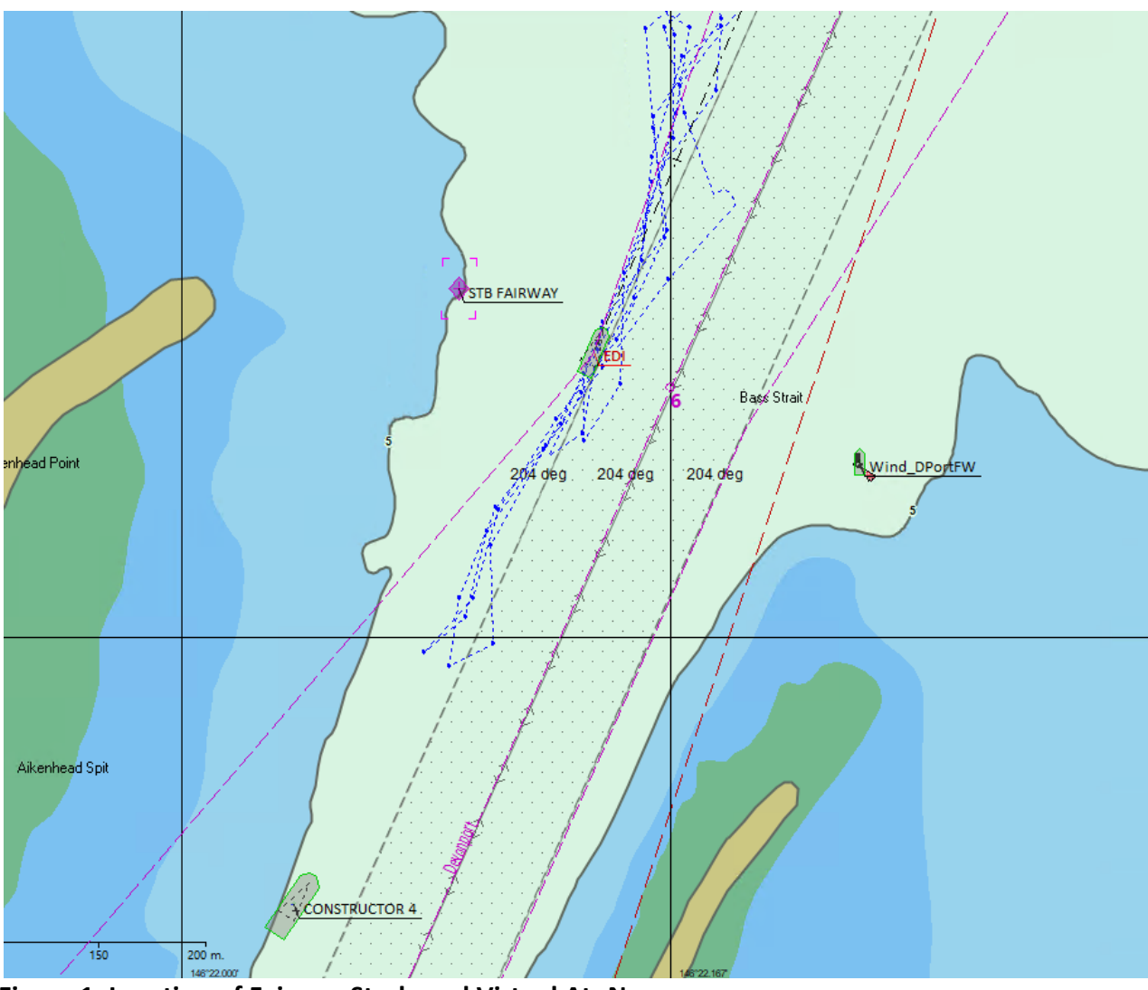
Figure 1: Location of Fairway Starboard Virtual AtoN

Latitude 41° 10.569' S, Longitude 146° 21.893' E Virtual Beacon, Port hand mark