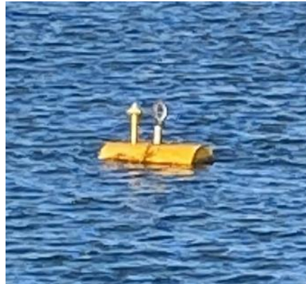
Figure 2 Rebecca Lily anchor buoy

During the works the Rebecca Lily anchors and steel wire anchor cables will be temporarily deployed into the swing basin at times between scheduled shipping movements. The anchors are identified by yellow can buoys and yellow flashing lights.