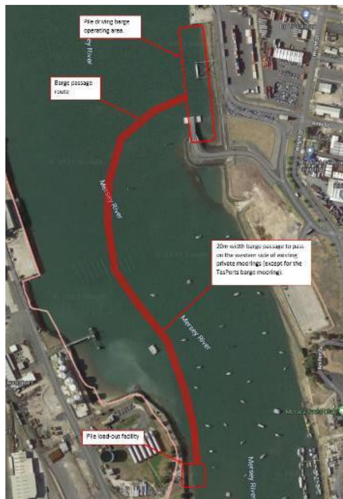
Pile Delivery Passage Plan

Construction piles and materials will be delivered to the Rebecca Lily via a transport dumb barge from the pile loadout facility at the 6 West mooring.