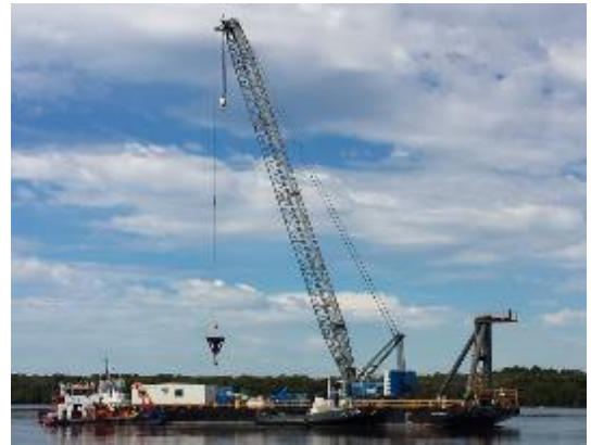
Berth 3 East Construction Zone and Rebecca Lily